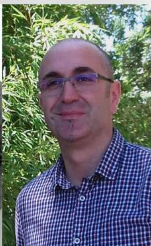
VICTOR Commercial Director